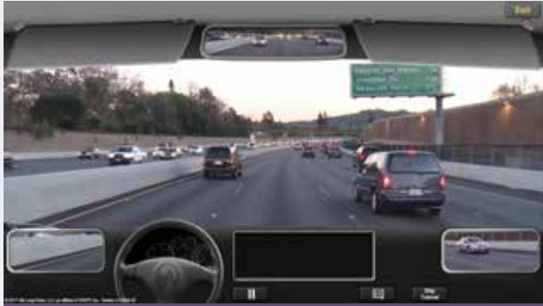
Example of teenSMART driving simulation