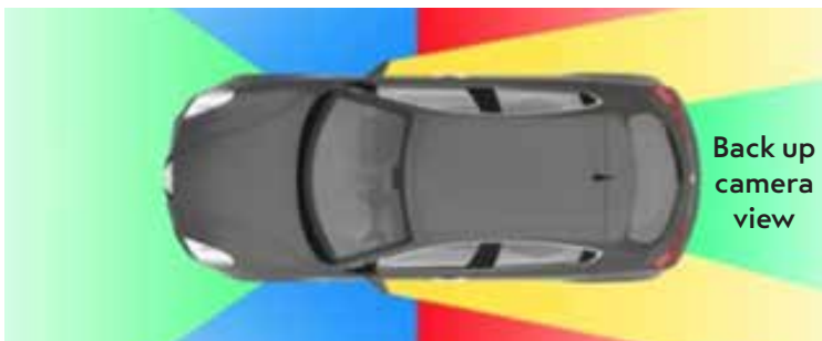
Back up camera view

Despite the quality of the image and size of the screens in the car, back-up cameras only provide a limited view of what's going on behind and around the vehicle. In fact, most cameras only provide an 80-degree field of view behind the vehicle. That leaves 280 degrees of view around the vehicle not accounted for if the driver only views the back-up camera while backing. That's why it's critical, for their own safety and the safety of those around them, that drivers do not become overly dependent on back-up cameras.